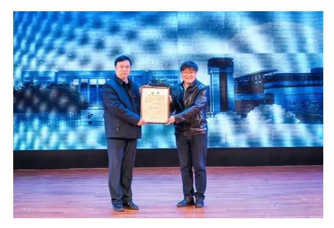
Certificate Awarding Ceremony

Northwest University started in 1902 as Shaanxi University Hall and Jingshi University Hall Accelerated Science School. It was called Northwestern University in 1912. In 1923, it was changed to National Northwest University. In 1937, the National Peking University, Peking Normal University, Beiyang Institute of Technology and Peking Research Institute, which moved westward to Shaanxi, formed the National Xi'an Temporary University. After the founding of New China, it became a comprehensive university directly under the Ministry of Education. In 1950, it was renamed Northwest University. In 1958, it was changed to be in charge of Shaanxi Province. In 1978, it was identified as a national key university. Now it is a national "Double First-Class" construction university, a national "211 Project" construction university, and a university jointly built by the Ministry of Education and Shaanxi Province.