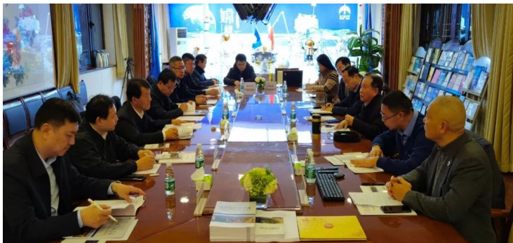
Yining Municipal People's Government and International Academician Consortium held a cooperation and exchange meeting to sign the Letter of Intent on Strategic Cooperation

The international academician consortium has also established cooperation with more than 20 enterprises, including Shandong Kelong Animal Husbandry Industry Co. Ltd. and Yiwu Zhebaimei Traditional Chinese Medicine Industry Development Co. base", "scientific research demonstration base," "scientific research pilot unit," etc., to provide talent and technical guidance services for enterprise development.