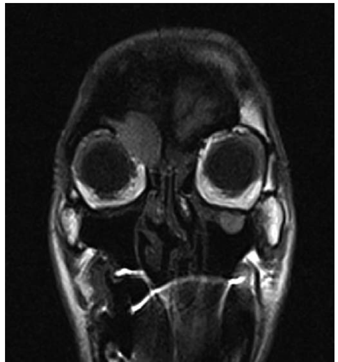
Fig. 2. Coronal MRI scan demonstrated the giant frontal mucocele with extension into the right orbit and anterior ethmoid sinus.

Even though frontal sinus mucocèles are benign and treatable lesions, they may cause serious complications through spreading to intracranial and intraorbital space with destruction of frontal sinus wall. Frontal sinus mucocèles represent a relatively rare, slow-growing pathology. They are usually clinically silent and are caused by the loss of drainage properties of the sinus mucosa. They can have orbital, anterior cranial fossa, and intracranial involvement. Posttraumatic or postoperative mucocèles can appear several years after the original event. Mucocèles