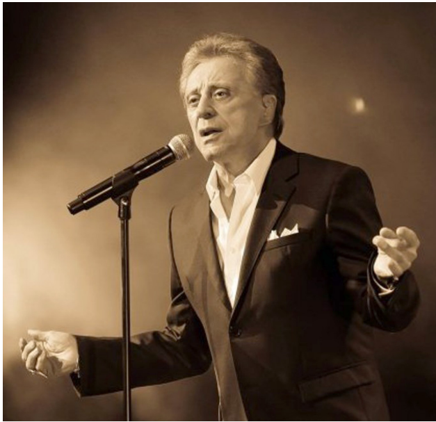
Figure 4. Frankie Valli on tour, 2022.

(Figure 4) is still going strong as a solo artist, now 50 years after the hearing-enhancing ear surgery for otosclerosis. 6,7 In 2023, he will give no fewer than 23 shows in North America and then 5 more venues in the UK. 8