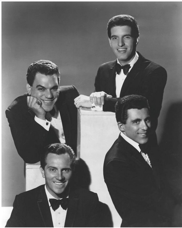
Figure 1. The Four Seasons in 1962. Frankie Valli, right below.